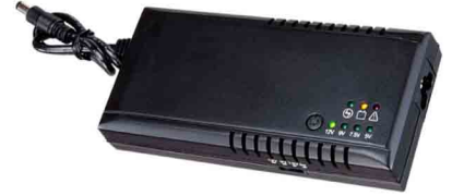
ON-B4000 / ON-B6000