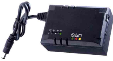
ON-B2200 / ON-B4400