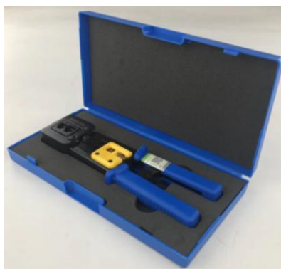
Optional type (need to add more charge)